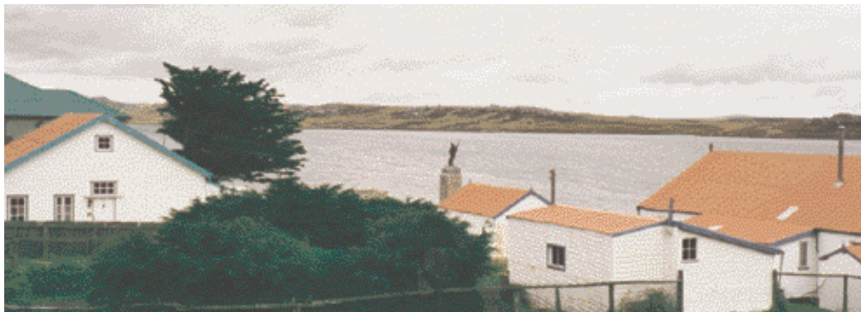
Stanley: Falkland Islands

2.6 Consultation with the territories showed a clear expression of their wish to retain the connection with Britain. We concluded that neither integration into the UK, nor Crown Dependency status, offer more appropriate alternatives to the present arrangements. But these arrangements need to be revisited, reviewed and where necessary revised.