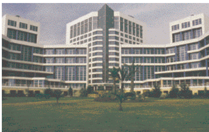
Europort Finance Centre, Gibraltar