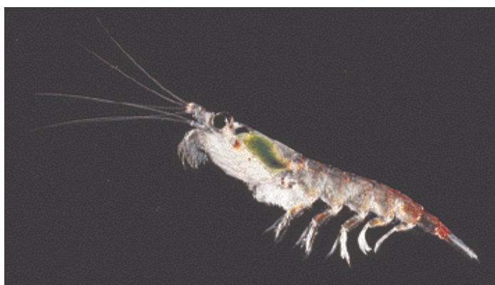
Krill – Euphausia superba – the staple diet of baleen whales, and many fish, seal and seabirds in the Southern Ocean, abound in the seas around South Georgia and the South Sandwich Islands.