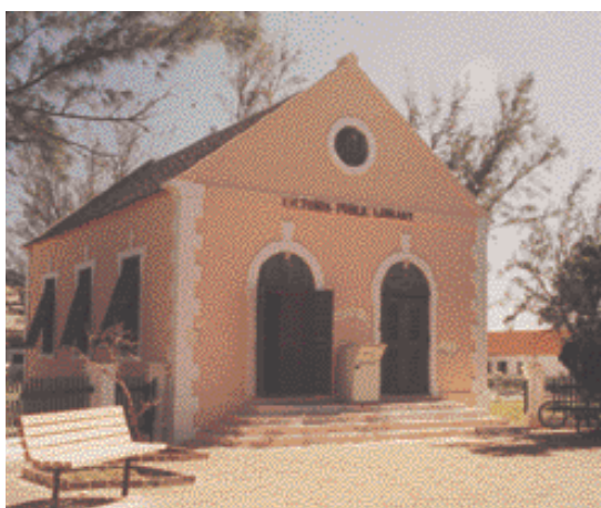
The Victoria Public Library on Grand Turk

7.6 The importance of this can be seen in the field of aviation safety. Bermuda and the Cayman Islands, who have both achieved US Federal Aviation Administration Category I status, have shown how high standards in aviation safety regulation can help in the development of a successful tourist industry. But there is a need to improve standards in other Caribbean Overseas Territories to ensure that foreign airlines can continue to operate services to those territories. The Civil Aviation Authority has agreed individual action plans with the territories that should help them reach and maintain minimum International Civil Aviation Organisation safety standards and, ultimately, UK standards.