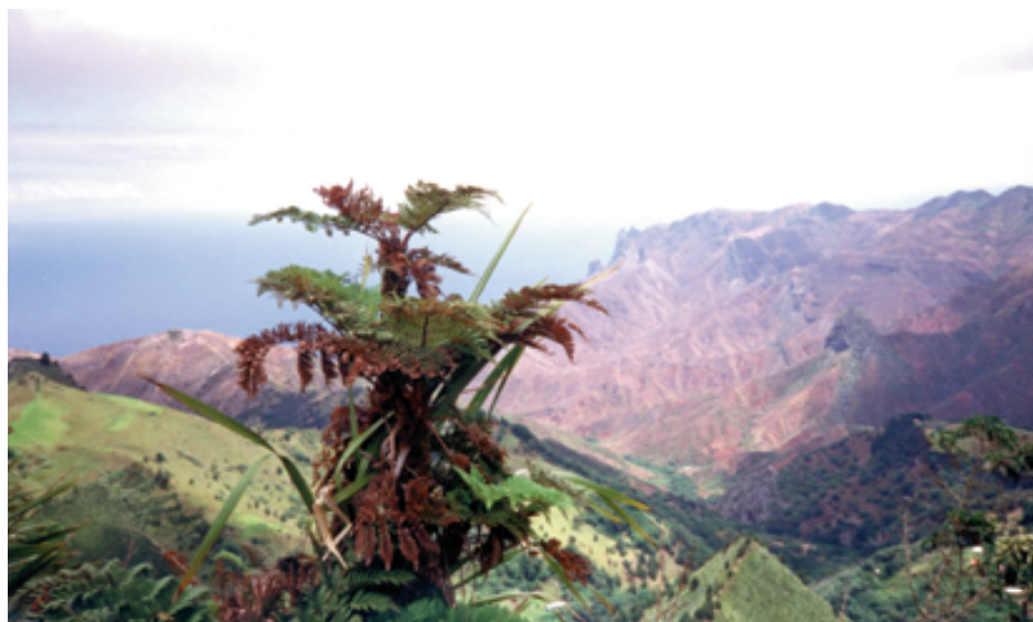
Endemic fern on St Helena