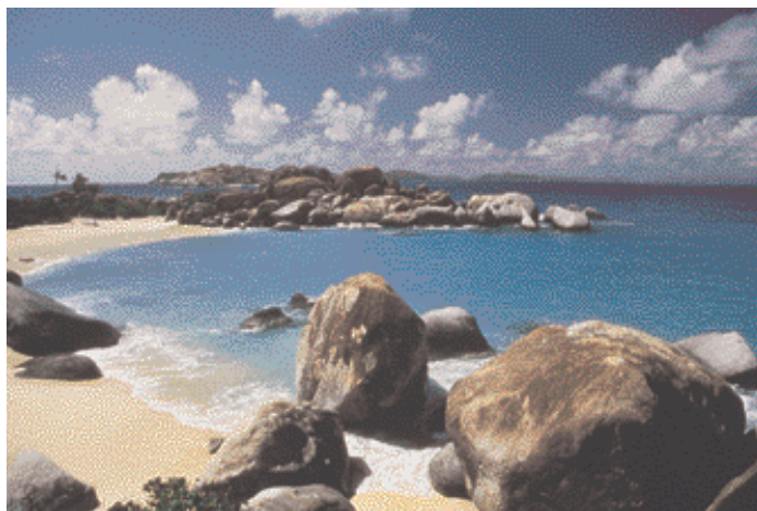
BVI Tourist Board