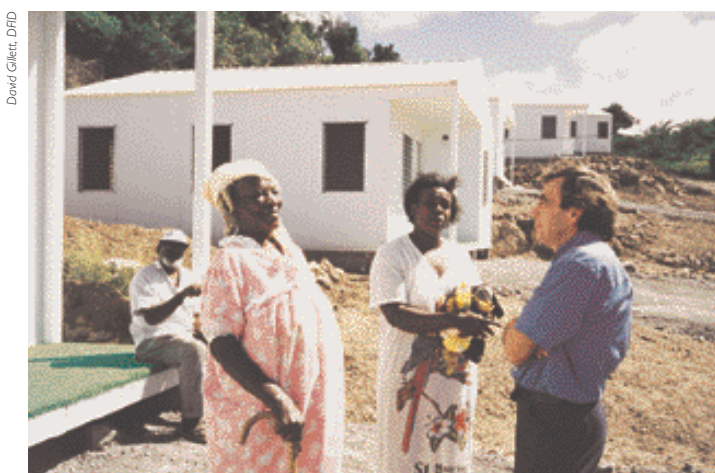
New housing project, Montserrat