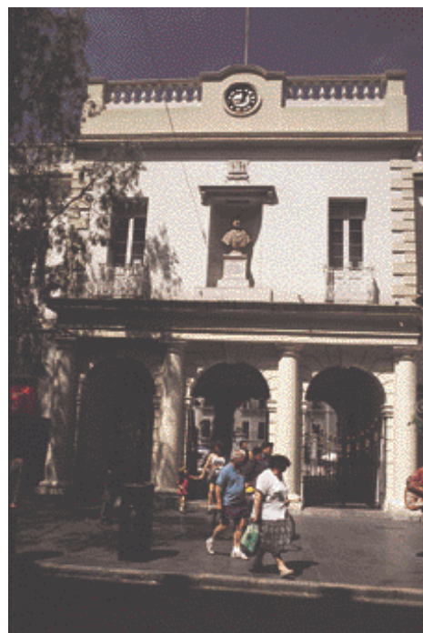
Gibraltar Information Bureau

4.4 Judicial corporal punishment remains on the statute books of the British Virgin Islands and Bermuda. It was abolished in Montserrat in 1991 and in Anguilla and the Turks and Caicos Islands in 1998. In the Cayman Islands abolition was begun in 1995 and completed in 1998. There is a belief in those territories which retain it that it provides a deterrent, particularly against hooliganism and juvenile crime. But in recent years, it has only been handed down as a sentence in the British Virgin Islands, the last time in 1996.