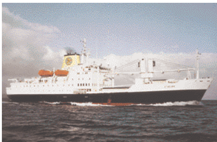
The RMS St Helena , providing passenger, mail and freight services to St Helena