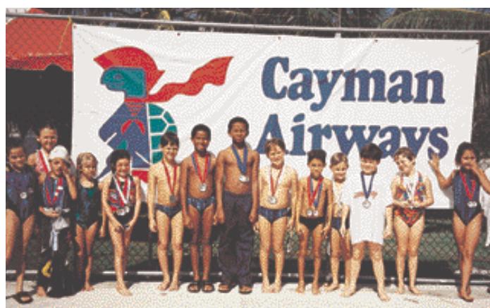
Swimming gala: Cayman Islands

3.3 These Acts were succeeded by the Immigration Act 1971, introducing the concept of the right of abode in the UK and ending the right of free movement to the UK of Commonwealth citizens, including people from the Dependent Territories.