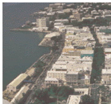
Overseas Territories Handbook

5.3 The success of the Overseas Territories has been built upon by their reputation for sound administration, effective legal systems, political stability and public order, and their association with the UK. These provide reassurance to would-be investors and business partners. It is essential for the future of the sector that this reputation for honest administration and probity be preserved and enhanced.