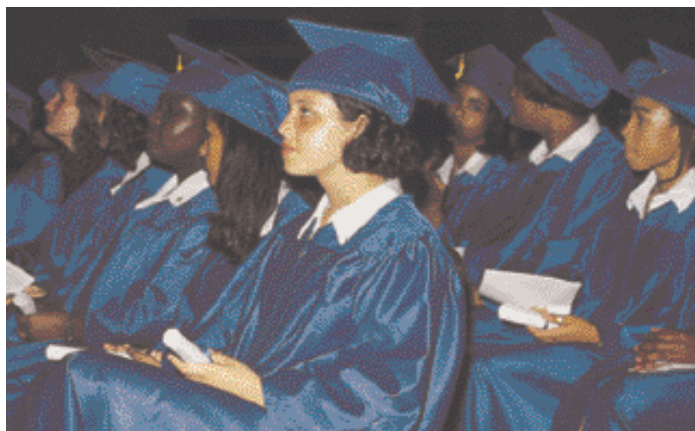
Cayman high school graduates