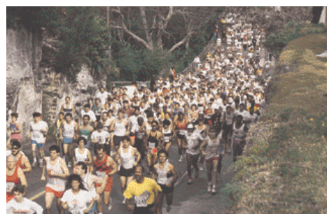
Hamilton, Bermuda: International 10 km race

Government of Bermuda Information Service