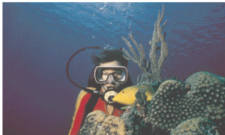
Diving in the Cayman Islands

8.2 The natural environment also provides a source of economic livelihood for many people in the Overseas Territories. The Cayman Islands, for example, relies heavily on the tourist industry, which in turn depends on the richness of the marine environment. The Falkland Islands and Tristan da Cunha, in particular, rely on sustainable fisheries.