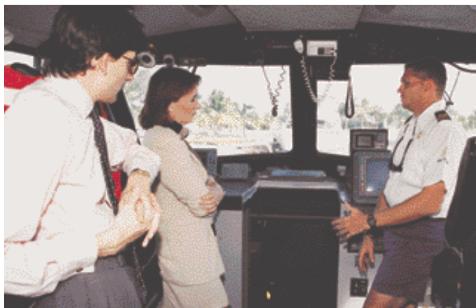
Cayman Islands Government Information Services

Overseas Territories Minister Baroness Symons being briefed by a member of the Drugs Task Force aboard the Royal Cayman Islands' police vessel, Protector .