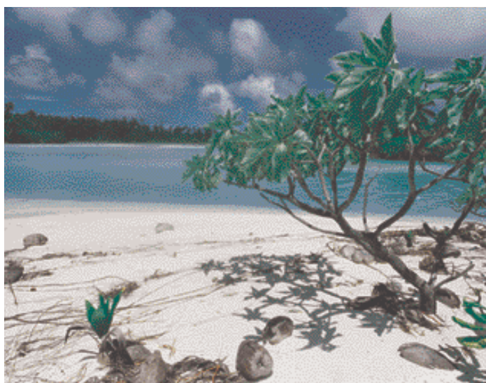
Low lying coral atoll: British Indian Ocean Territory

8.3 But these habitats and environments are under pressure. Some are threatened by uncontrolled development of the economic activities they help to sustain; others by introduced species of animals and plants; still others by changing conditions such as rising sea temperature linked to global warming. And these pressures rarely exist in isolation – sea temperature rise, for example, can kill coral reefs, which in turn means the loss of marine animals and plants. This disrupts ecosystems and exacerbates damage to resources on which people rely, such as fish stocks – often already under pressure.