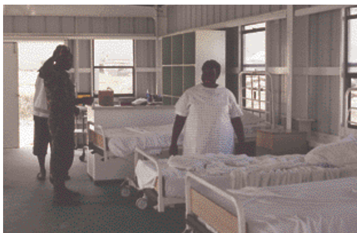
New hospital at St John's, Montserrat

7.14 The Overseas Territories also benefit from EC development assistance under the Overseas Countries and Territories (OCT) regulation of the Lomé Convention, financed from the European Development Fund. Our Overseas Territories are due to receive just over 19 million ecu (some £13 million) from this source for the present five year period up to 2000. European Community (EC) assistance has been used to help finance important infrastructure projects such as roads and water supply schemes in Anguilla and the Turks and Caicos Islands. Discussions are now under way for EC support for a number of projects including the proposed new wharf development in St Helena and for infrastructure support in Montserrat and Pitcairn. Funds are also available under the OCT regulation for Stabex payments (compensation for price fluctuations in basic export crops) and emergency aid.