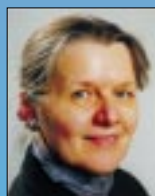
Vibeke Larsen The Danish High Commissioner

The Danish High Commissioner Amtmansbrekka 4 Box 12 110 Tórshavn Tlf. 31 10 40 · Fax 31 08 64 E-mail: riomfr@stm.dk