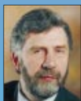
Eyðun Elttø, Minister of Energy, Oil Extractive Industry and the Environment