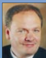
Finnbogi Arge, Minister of Trade and Industry