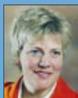
Helena Dam á Neystabø, Minister of Health and Social Services

The Coalition in power is composed of the Fólkaflokkur (The People's Party), Tjóðveldisflokkur (The Independence Party), and Sjálvstýrisflokkur (The Home Rule Party). The coalition has 18 of the 32 members of the Løgting.