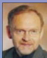
Signar á Brúnni, Minister of Education and Culture