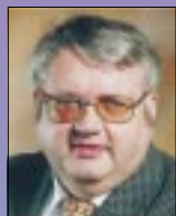
Anfinn Kallsberg, Prime Minister (løgmaður): His portofolios are Constitutional Affairs, Foreign Affairs and Municipality Affairs